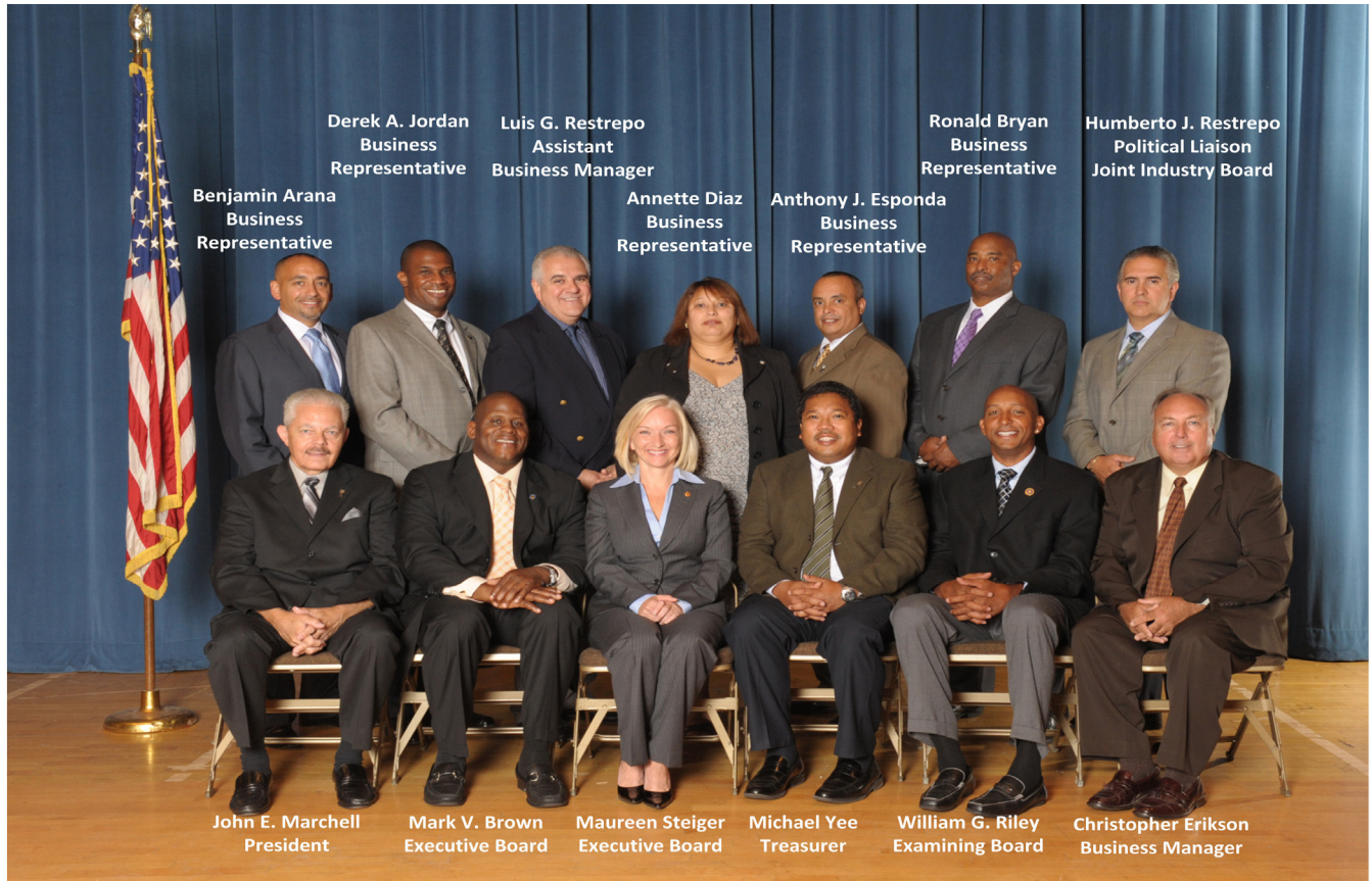
LOCAL UNION 3, NEW YORK, NY 2010